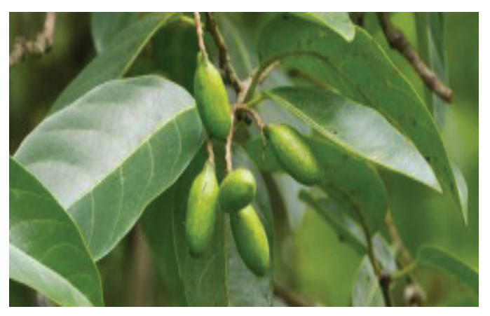
Fig. 2 Terminalia chebula fruits